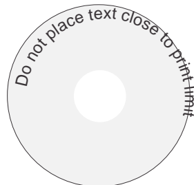
Keep print away from edges

Don't place text or important information close to or running round near the edge of the print area. Any small print alignment variations will be highlighted when you do this.