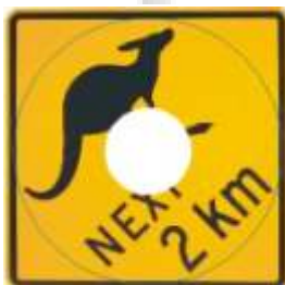
If you supplied this image, the corners of the sign would not be printed.

When we receive an image, we take it that you want the image placed as you see it to the left. That is, we place it so the image top, bottom, left, and right are at the physical limits of the disc.