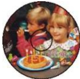
Don't cut out or shape image

Do not leave outlining circles on the image as they will be presented on the printed disc. Also do not make a round image, we will crop the image to suit the disc we are printing. As mentioned above, we require the image as a square 12cm image.