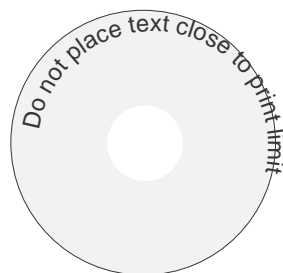
Keep print away from edges

Don't place text or important information close to or running round near the edge of the print area. Any small print alignment variations will be highlighted when you do this.