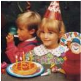
Poor framing example