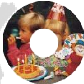
Poor framing example

Frame the image appropriately so you get the desired result on the disc. When selecting an image