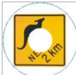
If you supply the image (shown by black outline) it would be placed to print the entire kangaroo sign.