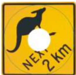
If you supplied this image, the corners of the sign would not be printed.

When we receive an image, we take it that you want the image placed as you see it to the left. That is, we place it so the image top, bottom, left, and right are at the physical limits of the disc.